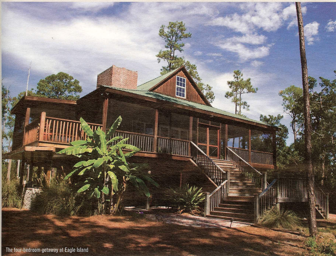
The four-bedroom getaway at Eagle Island